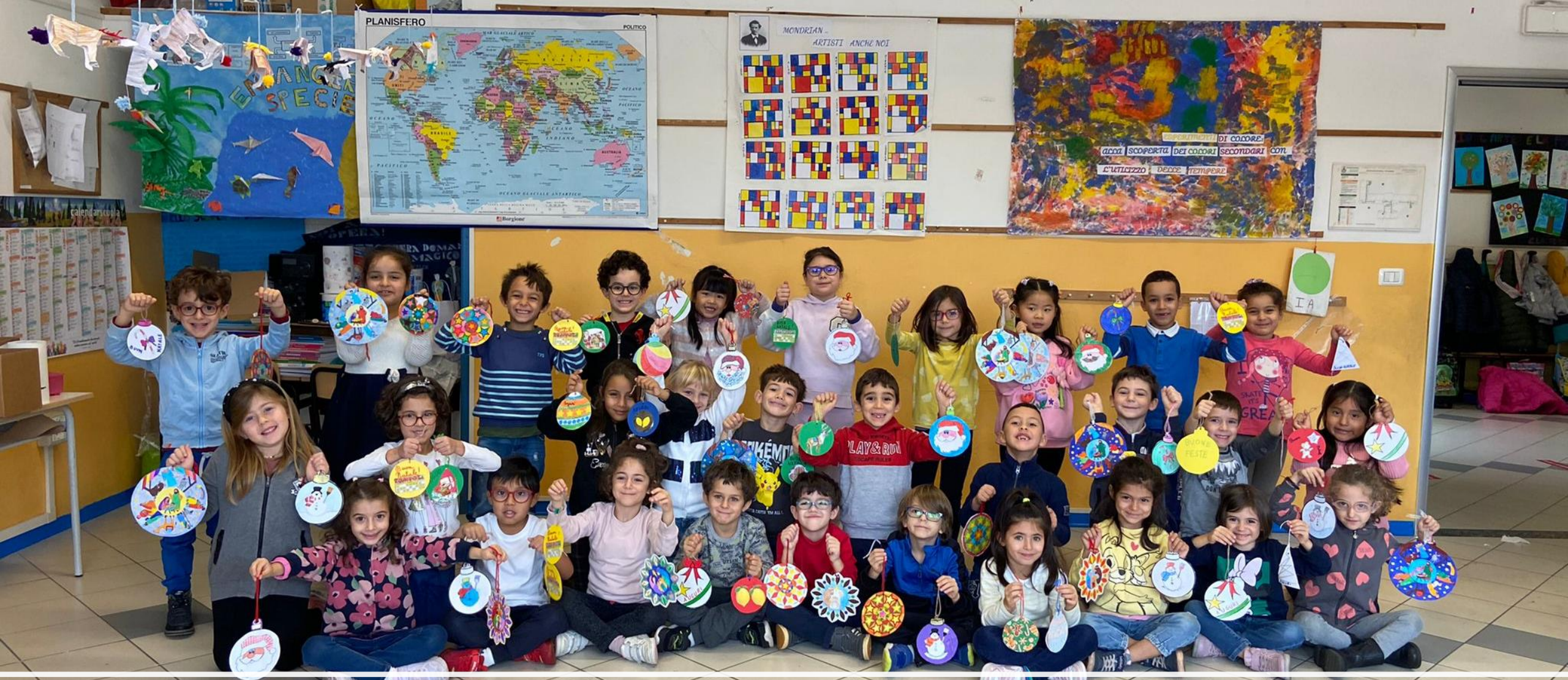
WE ARE THE YOUNGEST ONE! Classes 1 A and 1 B